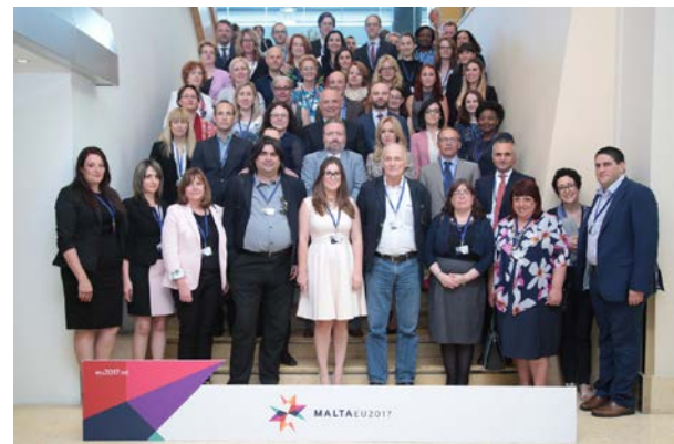
Delegates at the EMN Conference 2017 in Malta

The organisers brought together more than 250 experts from different fields (e.g. engaged in law enforcement and/or migration) from all EU Member States. In several panel discussions, speakers from the European Commission, EU agencies, inter-governmental and non-governmental organisations, academia and selected EU and non-EU countries presented their views on the implementation of the Common European Asylum System, including the current situation of asylum flows and possible future trends, the asylum procedures and reception conditions in the EU, existing legal pathways and resettlement programmes. Participants also discussed intra-EU solidarity and cooperation with third countries. The conference brought to the fore different asylum practices and lessons learned from various Member States.